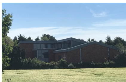
Side view of the new Baptist Church Building

Dunchurch Baptist Church: - Rev Dave Woods is continuing to put together a recording for a weekly service which also includes a family section appropriate for children. Access the latest service at http://service.dunchurchbaptistchurch.org.uk/